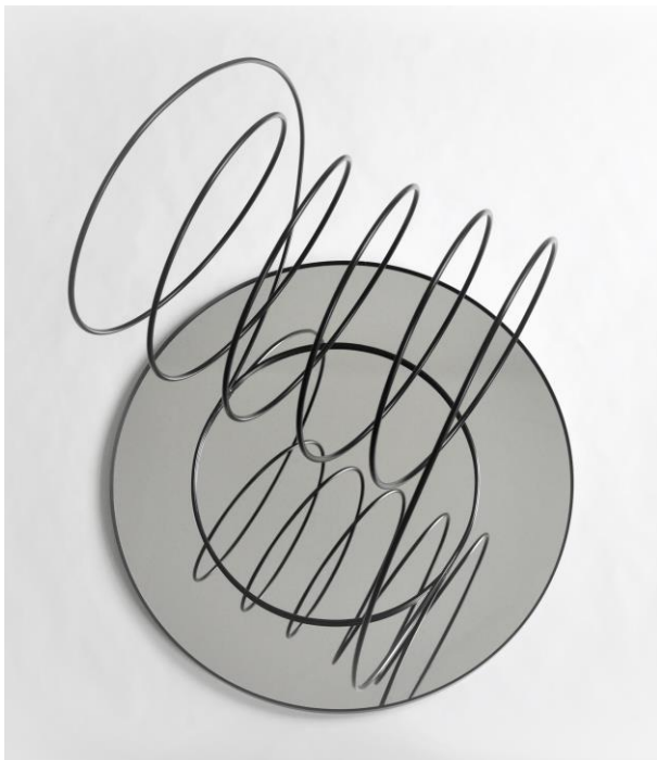
O.T. (FREIRAUM), 2021