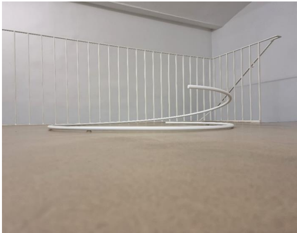
O.T. (KREIDEKREIS), 2021 room view: zsart Galerie, Wien

Information on Bildraum Bodensee image space: www.bildraum.bildrecht.at