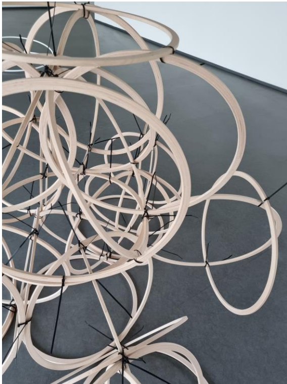
HULA HOOP, 2021